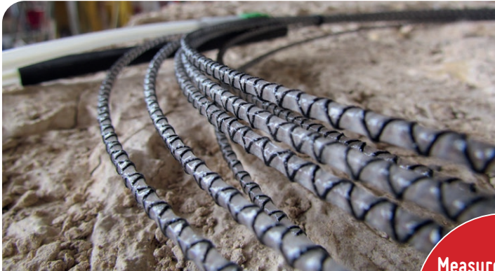
EpsilonSensor before installation in a lab specimen