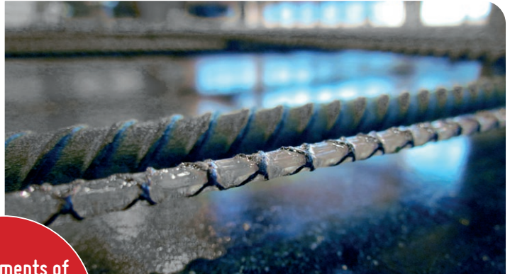
EpsilonSensor embedded into a reinforced concrete slab

Measurements of structural strains up to hundreds of kilometers!