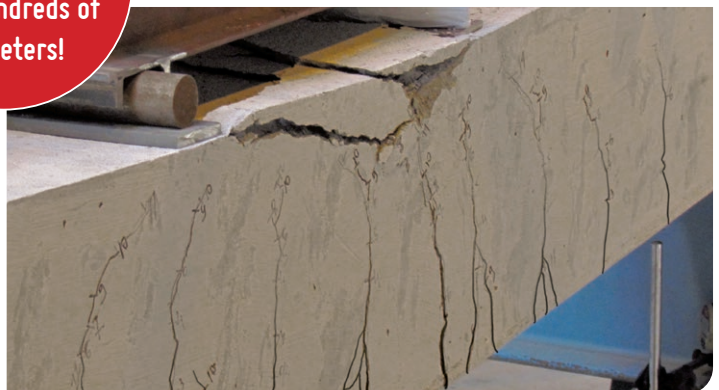
Crack measurements by EpsilonSensor during bending tests